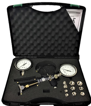
PGS40 Pressure Test Kit (Gauges not included)