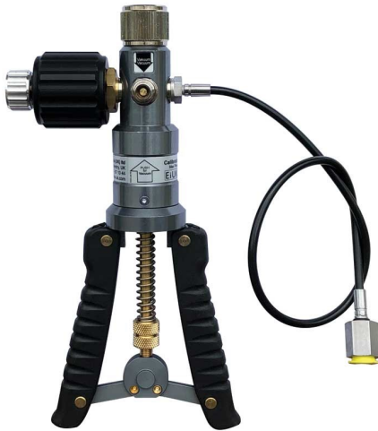
PGS40-OEM Hand Pump and hose