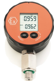
P11 Digital gauge ATEX