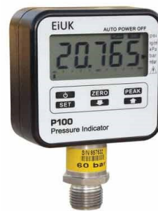
P100 Digital gauge