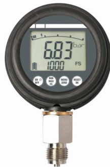
P11 Digital gauge