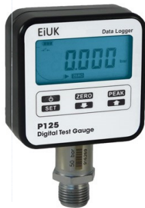
P125 Digital gauge with data logging